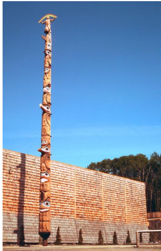
Rainbow at the top of the Unity Pole, Gitlaxt'aamiks