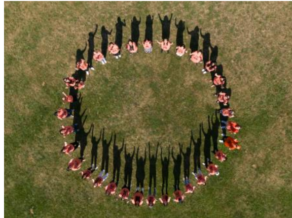
'Every Child Matters' Campaign— displaying a t-shirt designed by an UNYA youth and sold as a fundraiser for the Society

-an annual event of the BC Association of Aboriginal Friendship Centers. (UNYA youth participation made possible by donors)