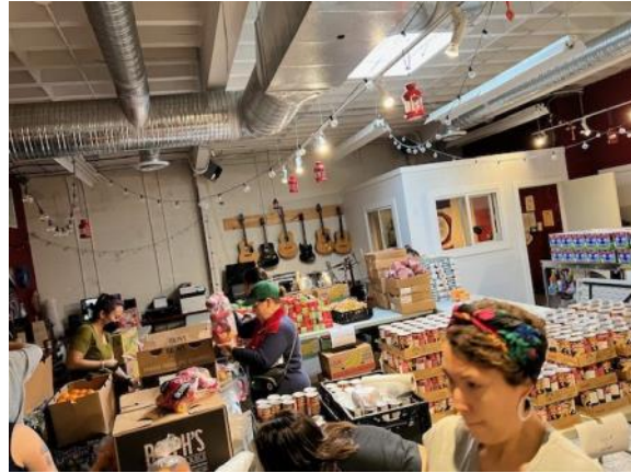
Food Pantry where youth can shop for free groceries to put food on the table for themselves and their families