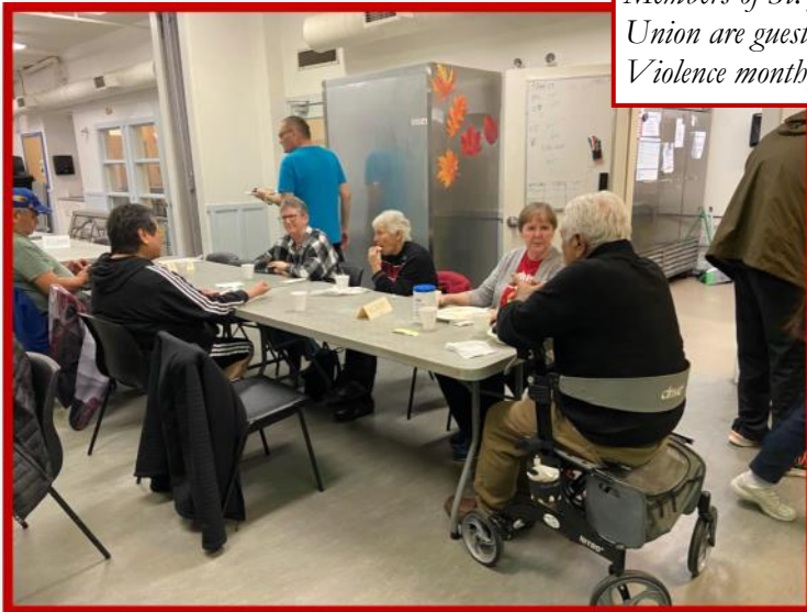
Members of St. James' Church Mothers Union are guests at a Warriors Against Violence monthly potluck supper

The Residential School system destroyed Aboriginal families. It left people powerless and victimized. Families became the setting for the acting out of anger and shame. At 'Warriors' men and women share their stories and free themselves from the impacts of abuse. Relationships of respect and equality begin, and men become the protectors of the family—not the perpetrators of abuse.