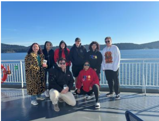
Youth en-route to 'Gathering our Voices' - four-days of events and workshops to "empower and inspire youth so they can contribute their gifts to their communities and the world."

-an annual event of the BC Association of Aboriginal Friendship Centers. (UNYA youth participation made possible by donors)